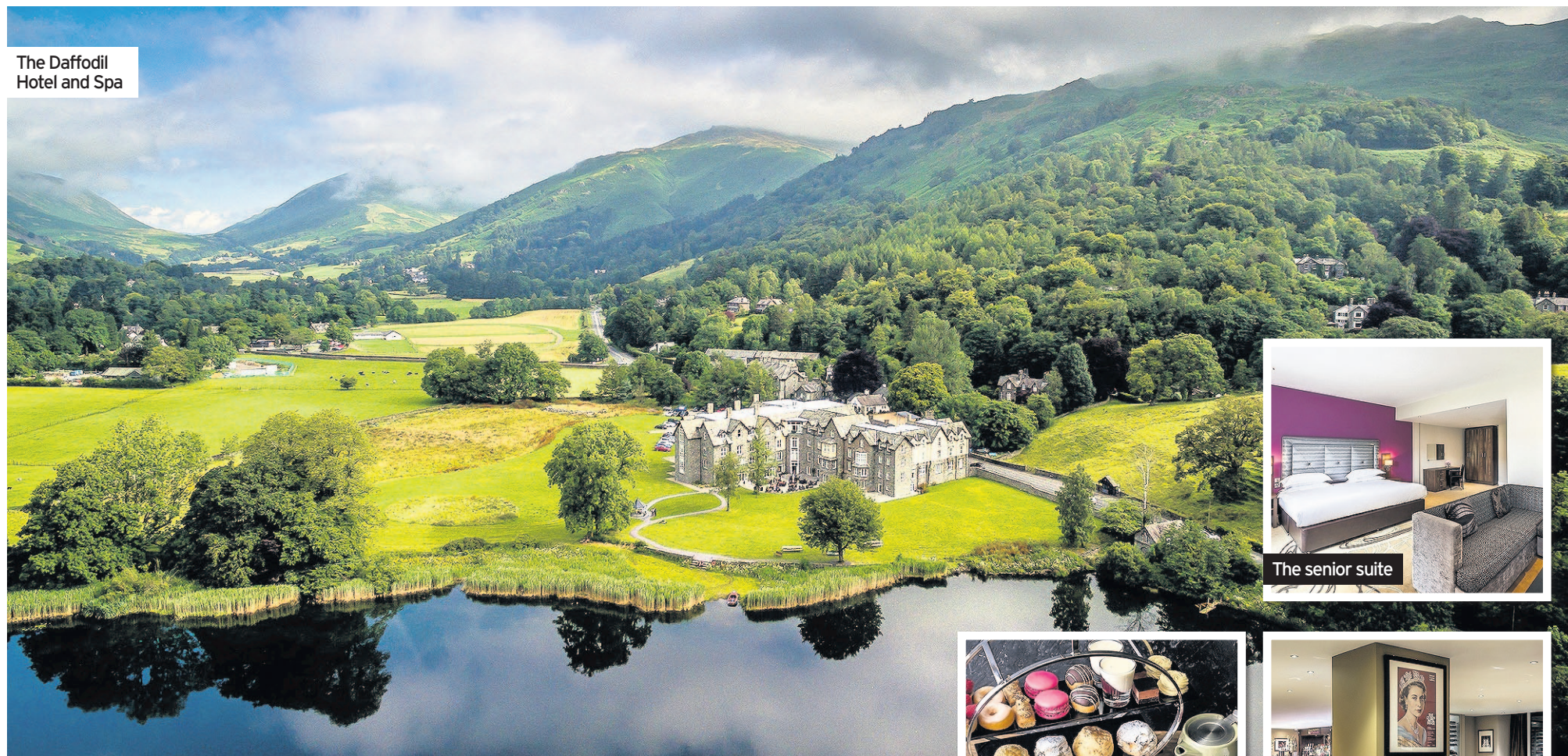
The Daffodil Hotel and Spa